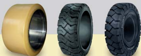
For Indoor For Comfort For Outdoor

The perfect combination of the articulated two-piece frame in addition to the pendulous twin load-wheels ensure permanent ground contact also on uneven floor conditions.